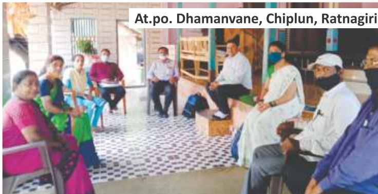
At.po. Dhamanvane, Chiplun, Ratnagiri

Shikshan Sarathi (Ashti, Beed) distributing masks to the children. The contribution was made by the community for the safety of their children.