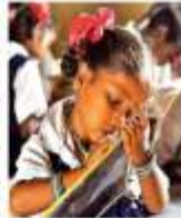
शांतिलाल मुग्धा फाऊंडेशनच्या सहयोगी शिक्षण अभियानात सहभागी विद्यार्थ्यांचा एक चित्र.

कालीन ४०० शैक्षणिक केंद्रांना सुरुवात झाली आहे. यात १०० केंद्रे प्राथमिक स्तरावरील विद्यार्थ्यांसाठी उघडण्यात येतील. यात १०० केंद्रे प्राथमिक स्तरावरील विद्यार्थ्यांसाठी उघडण्यात येतील. यात १०० केंद्रे प्राथमिक स्तरावरील विद्यार्थ्यांसाठी उघडण्यात येतील.