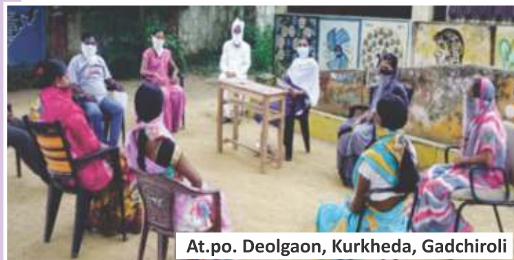
At.po. Deolgaon, Kurkheda, Gadchiroli

SMF Master Trainers and Shikshan Sarathi interact with parents to discuss Samaj Vidya Kendra's functioning